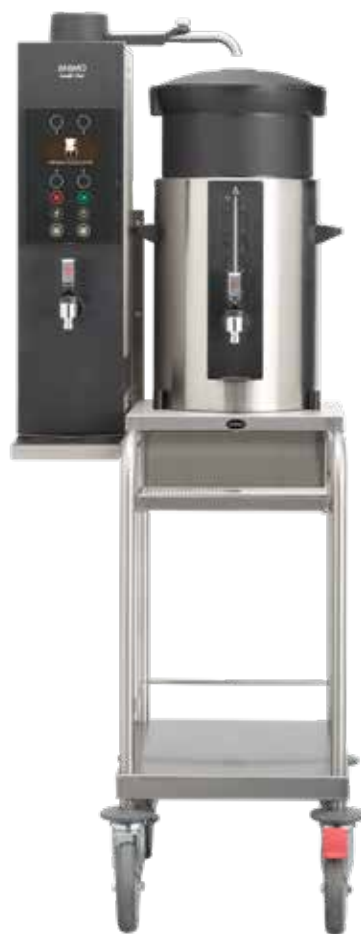
+ Type - J