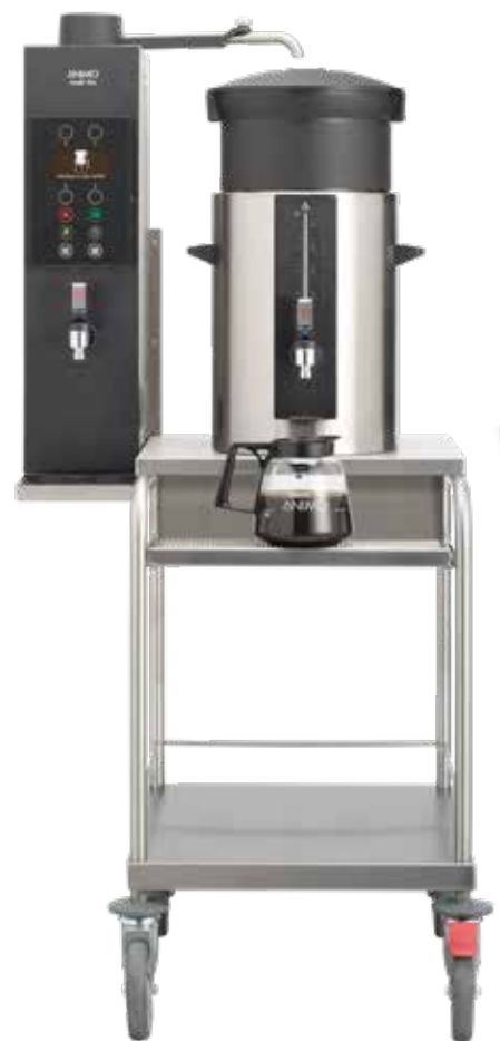
+ Type - S (Type - C is suitable for 2 containers)